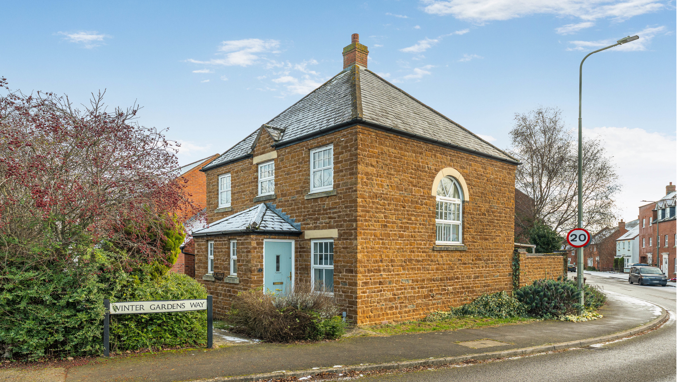
1 Winter Gardens Way Banbury, OX16 1UX